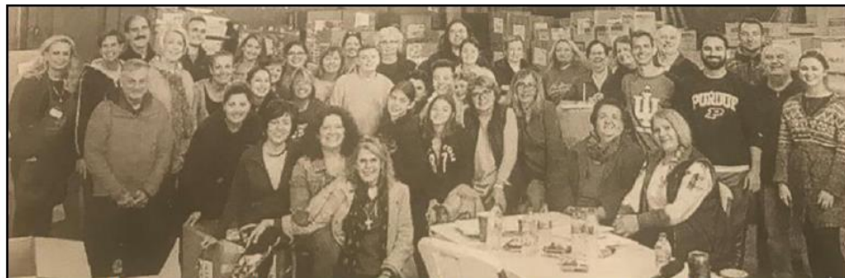
2019 Lifeline Christmas Packing, Lifeline Warehouse, Gary, Indiana Monroeville Kolo members and parishioners in attendance