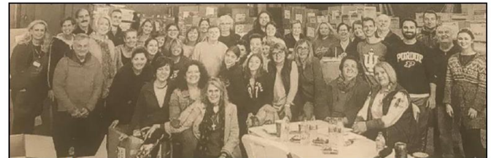
2019 Lifeline Christmas Packing, Lifeline Warehouse, Gary, Indiana Monroeville Kolo members and parishioners in attendance